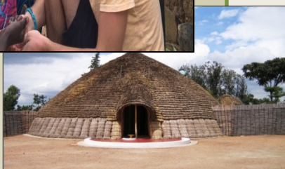
King's Palace, Nyanza