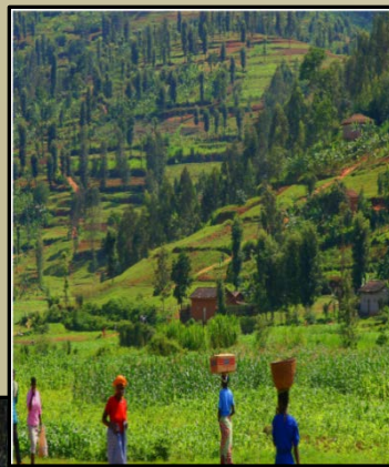
Land of a Thousand Hills