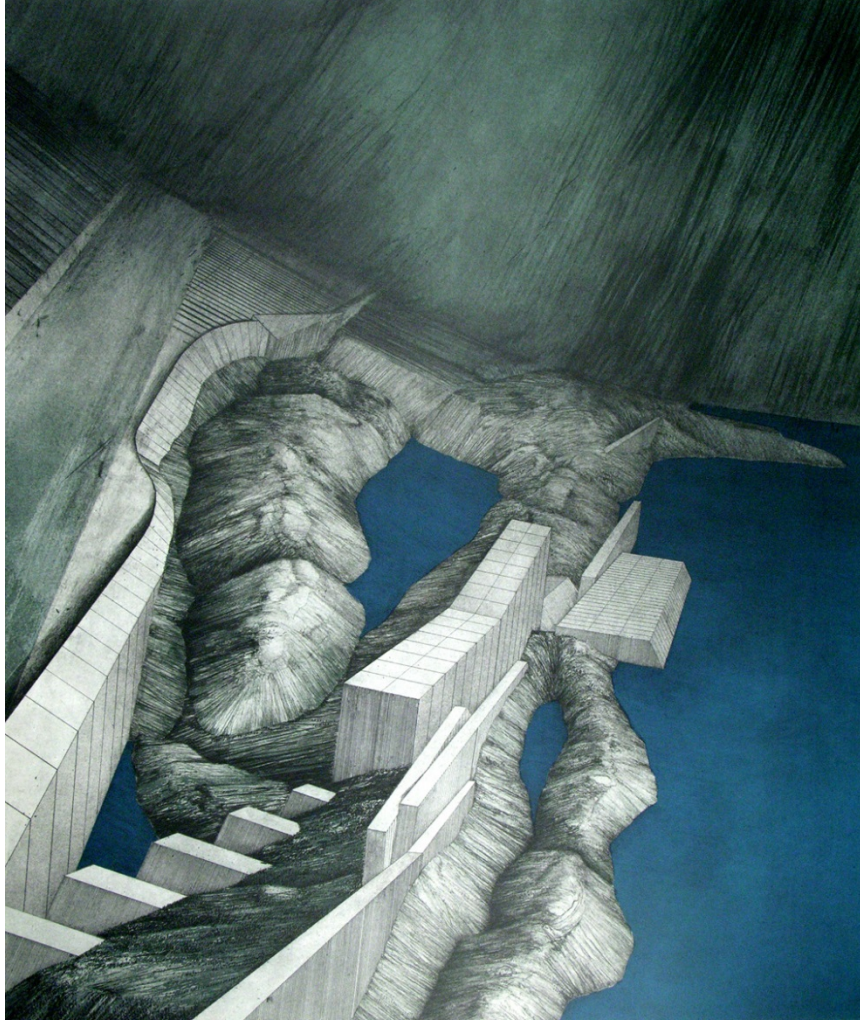
Figure 6: Landscape with Sloped Horizon (2004) Lithograph, 33 x 28 inches

My interest in form extends to a fascination with plants, insects and animals. It started with drawings of vegetables and continued in a series of images of insects, toads and farm animals. As I studied and drew these forms I was surprised by the complex structure as well as the variety of colors, textures, and patterns, and I became especially interested in beetles. They were beautiful but because of their size and appearance, they made me a little uneasy. I didn't want to hold a preserved specimen. It was interesting to me how beauty, fear and ugliness could co-exist with these creatures . . . and it reminded me how similar my concerns were when I was working with interiors and landscapes.