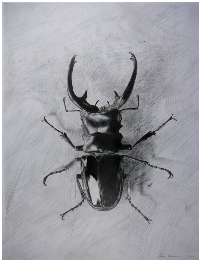
Figure 8: Odontalabis (2006) Graphite, 29 x 23 inches