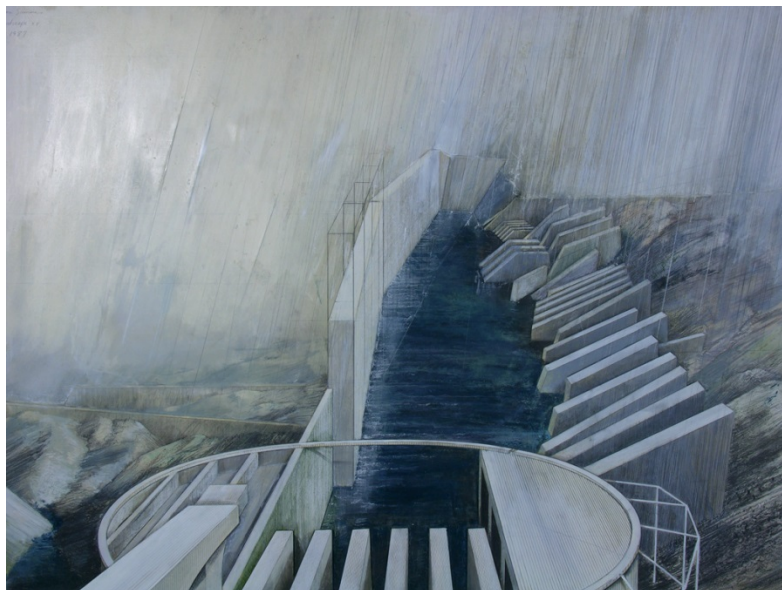
Figure 1: Landscape XX (1987)

A s a boy in Buffalo, New York, Evan Summer had many occasions to view Niagara Falls. The unusual perspective—“looking down at something so majestic”—impressed him, as did the massive hydroelectric power plants that dominate the landscape around Niagara Falls. In images like Landscape XX , or Darkening Sky , these visual memories from childhood assert themselves yet become something very different: the massive man-made structures are tumbling, or sliding; the natural forms seem less majestic than menacing, encroaching upon what man has made. Drawn into the landscapes by Summer’s strong perspective lines, the viewer finds himself in uncertain terrains, under dramatically changeable skies. These are, Summer says, “desolate places where there’s just no end to them and no sense of direction or goal . . . just more landscape to wander through.”