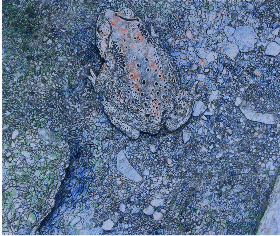
Figure 9: Toader (2012) Lithograph, 10 x 11.5 inches