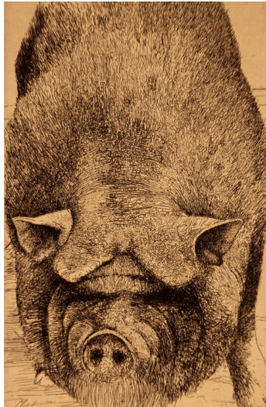
Figure 5: Baby Phattie (2012) Etching, 9 x 6 inches

The interiors and landscapes reflect time, history and memory. Things have been built and events have occurred in these places but now the abandoned structures are the only sign of human presence. They are about time and change, and are symbolic of conflict—conflict between human creation and the forces of nature. I feel a sense of mystery even though I created these pictures. In all my work there is a strong interest in form and space, and also for craft and tradition. Linear perspective, mark making and technique are intertwined inseparably with imagery, and the two have evolved together in my work.