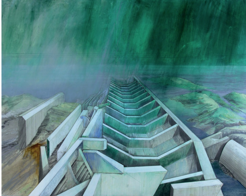
Figure 2: Darkening Sky (1987)

Collage of paper and board on aluminum with graphite, pastel, powdered pigment, and acrylic, 60 x 75 inches