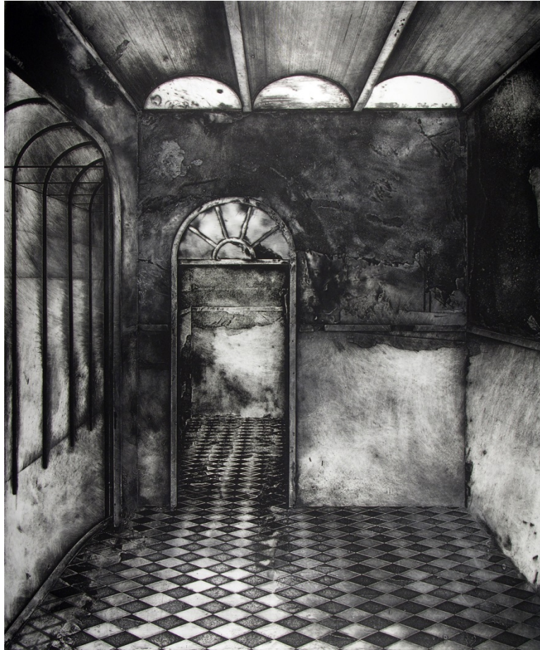
Figure 3: Interior X (1982) Collagraph, 30 x 25 inches

Imagery and technique, Summer says, “have become so intertwined in my work that it’s hard to separate one from another.” Discussing his work Summer uses the phrase “mark-making,” language particularly meaningful to printmakers. “Most etchings, or some etchings,” he says, “are printed in black or one color. We don’t have the variety of color, all we have is tone, and that’s made with marks. And so the texture, the nature of the surface, is all determined by the marks we make.” Through his precision in “making marks,” Summer builds images that are structural, dynamic, atmospheric . . . and beautiful.