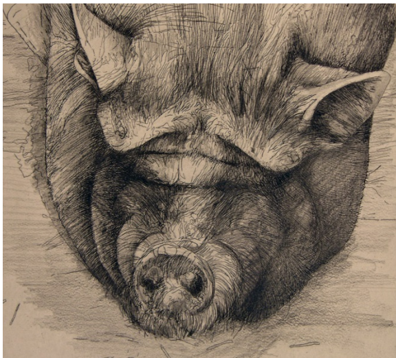
Figure 4: Preliminary Drawing

The etching plates are created over a period of time and in many steps on copper plates. In the exhibition I've included the plate of Baby Phattie , a small print of a pig, along with the preliminary drawing and final print. Collagraphs are printed from plates that are built up like collages. Like the etchings they are hand inked and printed by hand, one at a time, in small editions.